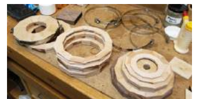
Glued & Flattened