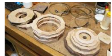
Glued & Flattened