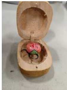
"Trembling Bug" gifted item