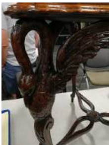
Paul Murphy- "refreshed" carved table,