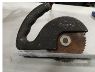
From ?? -a Mystery Tool