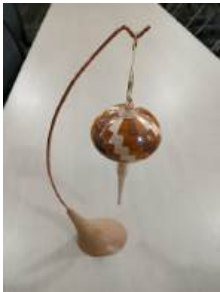
Joe Ferrier - segmented ornament and base