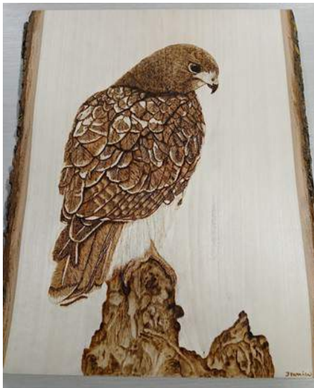
From Trudy Ferrier Woodburned Red Tail Hawk