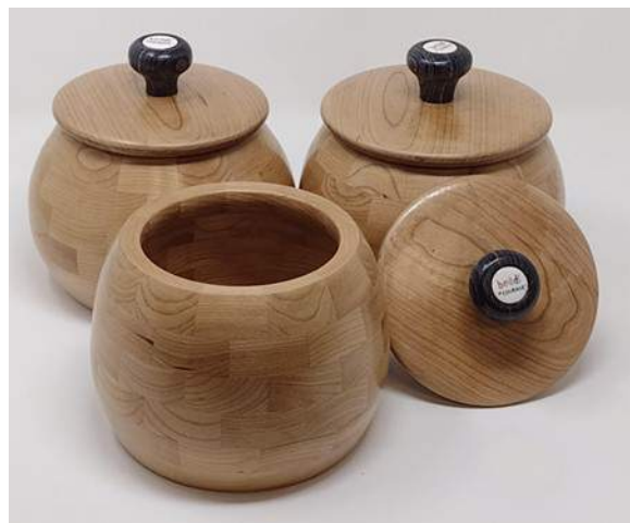
From Al Ostermann Turned, segmented bowls for Beads of Courage program