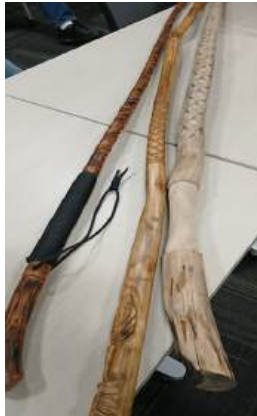
Dave Kaus: hand carved walking sticks ( one with dragon skin pattern)