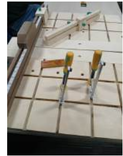
Glen Koehler: cross cut sled