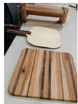
George Brudi: cutting board, pasta press, paddle