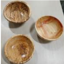
Bill Kocha: Box Elder & Maple Bowls