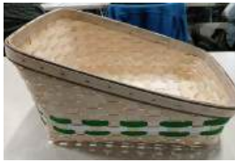
Jim Michiels Baskets: Black Walnut/Ash/Maple; Yellow birch