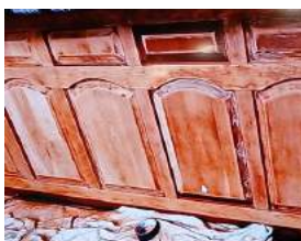
Prep in progress

A video of this presentation is in the NEWWG library, available at meetings.