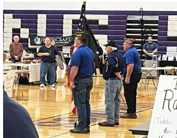
A salute to our veterans on Veterans Day