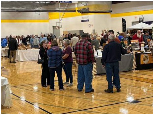
A great turn out!