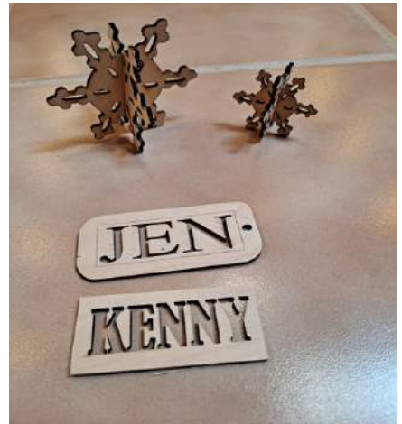
Laser cut images from Gary Emerich

Inside out ornament, black walnut from Larry Lienau